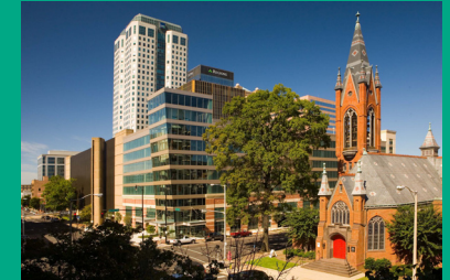
A longer view shows how the parking deck expansion responds to its context. The stair/elevator tower provides unusual views of the 1888 First Presbyterian Church.