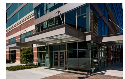
Steel and glass canopies hang above the main entrance and selected storefronts. Retail uses can be retrofitted as the market demands.

As in other projects, Williams-Blackstock gave special attention to illumination. Particularly effective is the lighting that turns the glass cladding into a continuous glow after dark.