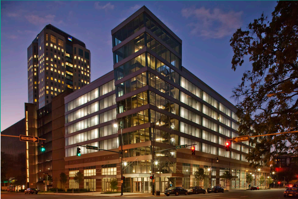
This dusk view provides a view into the dramatic tower at the southeast corner of the deck that holds the main stair and elevator lobbies. A wash of light turns frosted glass on upper floors into a welcoming lantern.