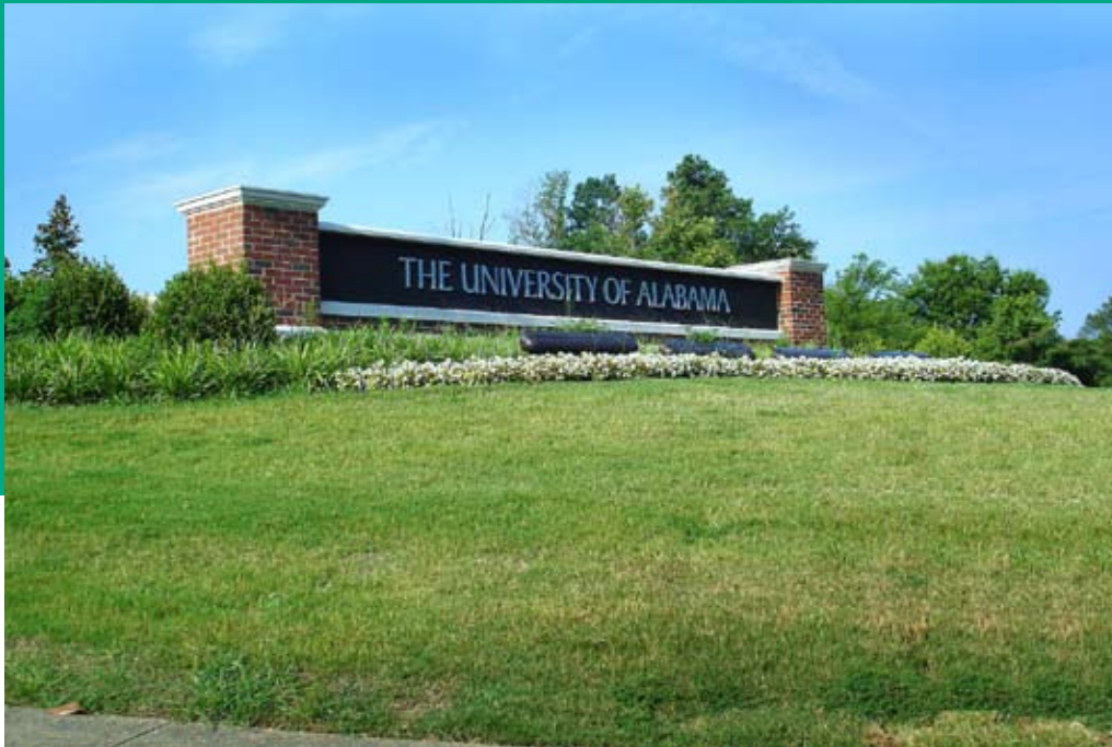
The graphics master plan covers identification, like this major campus gateway sign, as well as wayfinding for various precincts.