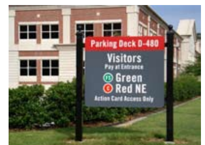
Directing visitors to public parking near their destination is a key component of the UA campus graphics plan.