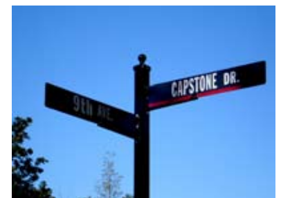
Street signs are also made a part of the graphics system.